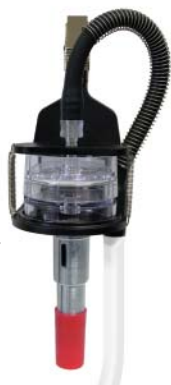
Cyclone-cassette assembly in filter cassette holder accessory