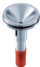
SKC Aluminum Cyclone

The lightweight filter cassette holder is designed to attach to a worker's collar and will accommodate either 25-mm cassettes with cowl or two or three-part 37-mm cassettes with or without a cyclone.