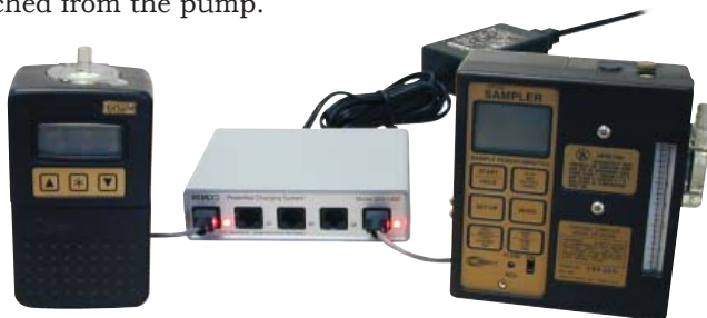
Five-station PowerFlex charging the AirChek 2000 and PCXR8

Pump-specific cables are used to connect battery packs to the PowerFlex. Simply plug the appropriate cable into a PowerFlex port and plug the other end into the appropriate pump charging jack. An LED indicates charge mode. PowerFlex charges most battery packs within six hours and automatically switches to a safe pulse trickle charge when full charge is detected. Each attached battery pack runs through an independent charge cycle. Battery packs can be charged either attached to or detached from the pump.