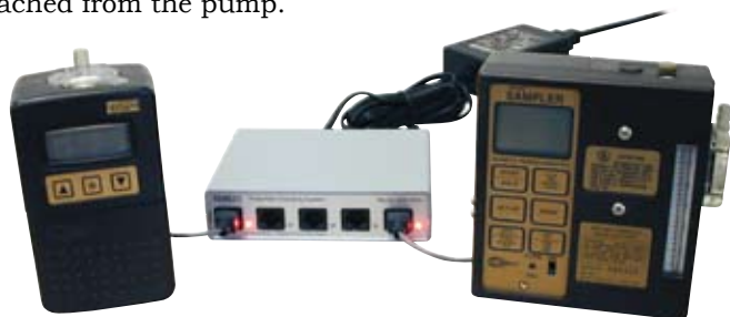
Five-station PowerFlex charging the AirChek 2000 and PCXR8

Pump-specific cables are used to connect battery packs to the PowerFlex. Simply plug the appropriate cable into a PowerFlex port and plug the other end into the appropriate pump charging jack. An LED indicates charge mode. PowerFlex charges most battery packs within six hours and automatically switches to a safe pulse trickle charge when full charge is detected. Each attached battery pack runs through an independent charge cycle. Battery packs can be charged either attached to or detached from the pump.