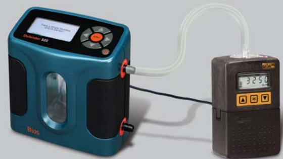
AirChek® 2000 in CalChek calibration train