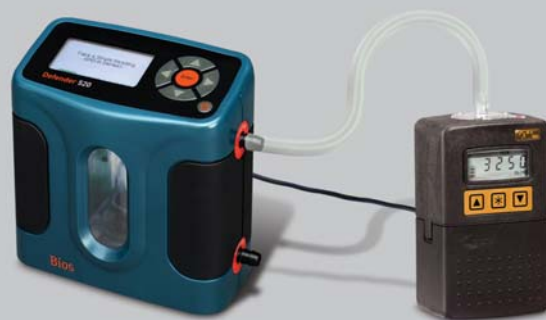
AirChek® 2000 in CalChek calibration train