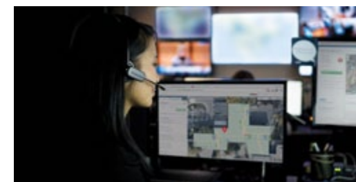
24/7 Blackline Safety Operations Center (SOC)