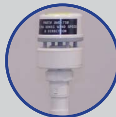
Optional ultrasonic wind speed and direction measurement