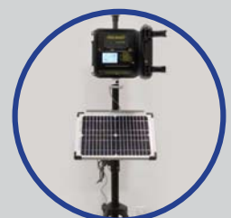
EPAM-7500 on optional tripod with solar panel