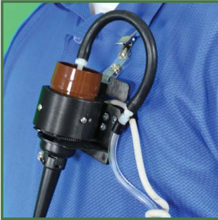
Clip the sensor with GS-3 Cyclone to a worker's collar in the breathing zone.