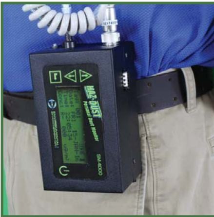
Clip the SM-4000 to a worker's belt.