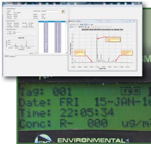
Read dust concentration on the SM-4000 display. Download data for graphing/reporting.