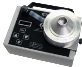
BioStage mounted on QuickTake 30 Pump with mounting bracket accessory